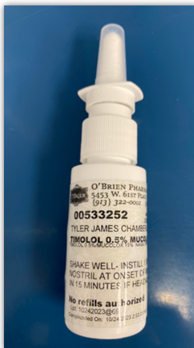
Figure 1. Sample nasal timolol 0.5% prescription (figure used with permission from Tyler Chamberlain, PharmD).

Timolol 0.5% nasal spray was prescribed for acute migraine treatment. She reported this to be quite helpful in aborting migraine attacks that broke through her preventive medications. Over time, she has used nasal timolol spray for multiple migraines with recurring success. She continues to use timolol nasal spray as a first line acute treatment option. She has reported no side effects. The preventive medication adjustments, along with this novel acute treatment option, led to cessation of her overuse of OTC analgesics. She reports a notable improvement in her personal and professional life.