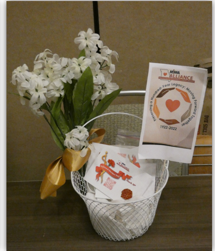
The Alliance handed out carnation lapel pins for MSMA physicians in honor of National Doctors' Day.

Fall Conference for its location (Kansas City University) and Missouri Association of Osteopathic Physicians and Surgeons (MAOPS) Auxiliary guests. She highlighted the fund-raising efforts for the Missouri State Medical Foundation, and the Advocacy Day turnout with the combined membership of MAOPS. Our participation in the annual Match Day celebrations for Missouri's medical schools has expanded this year to include the osteopathic schools of medicine, and we are ever so grateful to be participating with them. The inclusion and involvement of students are our future as a professional organization.