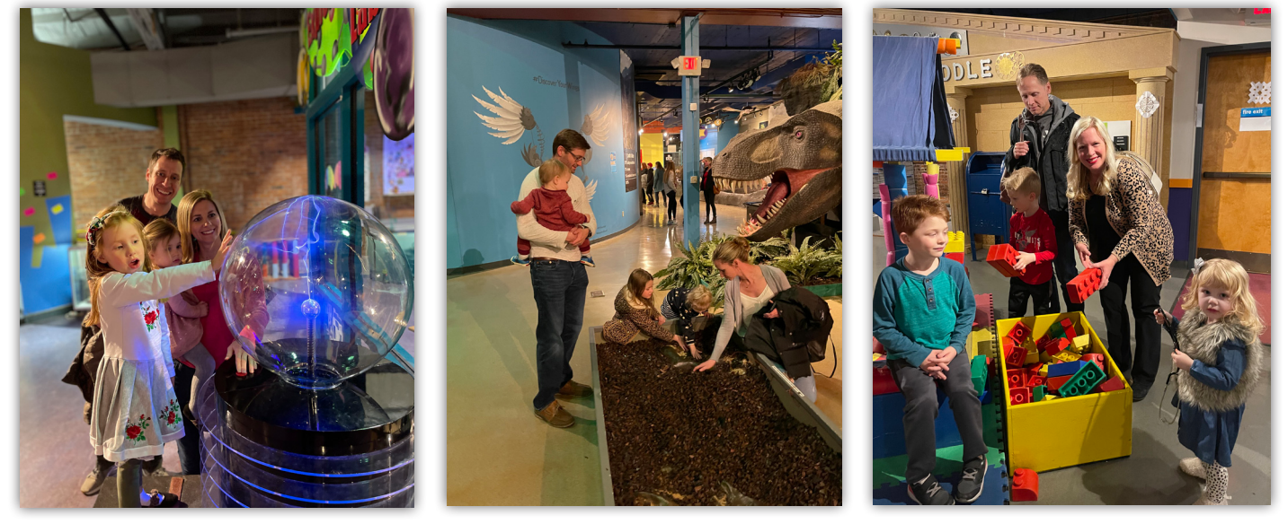
6 | Show Me Alliance News | March 2022

The Greene County Alliance hosted its fourth annual Physician Family Night at the Museum held Feb. 26 at the Discovery Center in Springfield. The GCMS Alliance welcomed physicians and their families for a night filled with food, fun, and fellowship. The attendance has increased steadily each year and the opportunity to visit all the exhibits at the Discovery Center after hours is a real treat. This event is held as part of our Taking Care of Our Own project which focuses on physician wellness. Family-oriented activities and socializing with others who understand the stress of the profession is seen as a way to fight against physician burnout. We wish to thank Ferrell Duncan Clinic and Mercy for their continued efforts in helping us to address this issue. See fun family photos below.