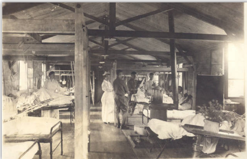
Figure 1. Surgical Ward, Base Hospital 21 in Rouen, France 1918.

still considered a wide-open western boom town. If St. Louis was the older, famous, urbane Missouri sibling, Kansas City was its rambunctious younger brother with great potential but still-untamed behavioral issues, as will be discussed.