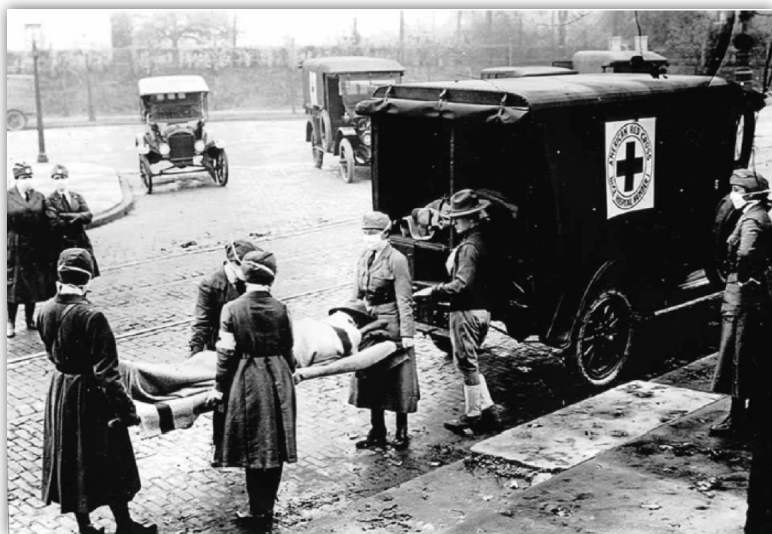
Figure 4. American Red Cross workers, St. Louis 1918.

For several decades in the late 19 th and early 20 th centuries political bosses ruled the city. According to the Kansas City Star in 1918, “practically every member of the health and sanitary departments (held) their jobs by the grace of the bosses.” Further complicating matters, in 1918 Tom Pendergast and Joe Shannon had reached a “50-50 agreement” to share power with the result that public board members were split in their allegiances. The palpable animosity among board members severely hampered an effective public health response. A detailed description of this dysfunctional situation is provided by Sykes-Berry. 15