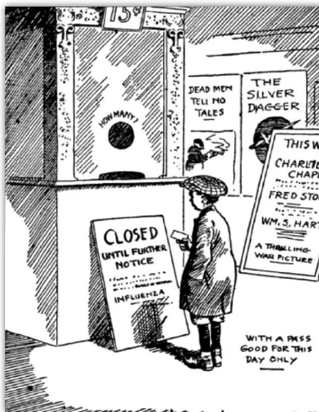
Figure 3. "Life's Darkest Moment" Kansas City Times , October 19, 1918.

The first influenza cases in Kansas City were reported at the Sweeney Automobile School, a private facility converted to military use, during the last