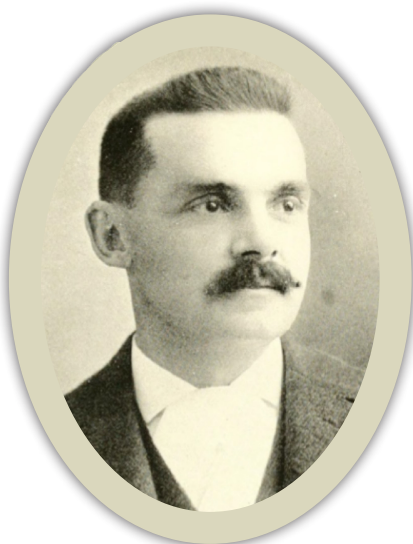
Figure 2. Dr. Max Starkloff, St. Louis City Health Commissioner during the 1918 influenza pandemic.

In late September St. Louis hoped to avoid the devastating experiences recently reported in eastern cities. The City Health Commissioner, Dr. Max Starkloff (Figure 2), son of a Civil War surgeon and great grandfather of the founder of the Starkloff Disability Institute, was a clear-headed, effective, and